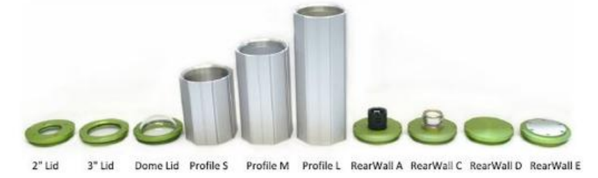
Order Numbers (please specify the camera type for each order!):

autoVimation offers a wide selection of enclosures to suit even the most specific requirements. To find a suitable enclosure please see the Enclosure Configurator (link above) or contact OEM Finland sales team for additional info!.